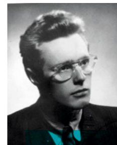
MEDICAL CLASS OF 1955